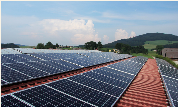
Solar Water Heating