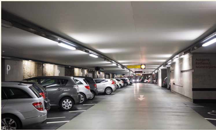
Multi-Storey Car Park